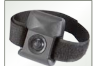
ADVANCED WIRELESS REMOTE CONTROL