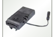
Part No. ATAM000004 RECORDER DT DIGITAL VIDEO RECORDER