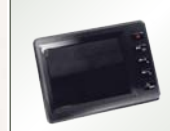
Part No. ATAM000005 HD DVR DIGITAL VIDEO RECORDER