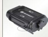
Part No. ATAM000008 EXTENDED BATTERY PACK