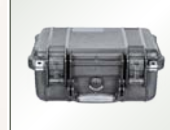
Part No. ANHC000001 HARD SHIPPING/ STORAGE CASE #101