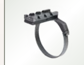
Part No. ATAM000003 PLATFORM RING